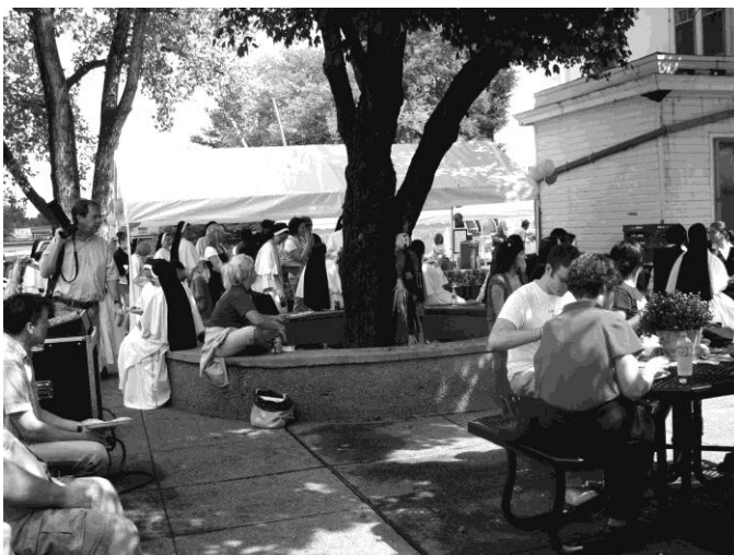
Fall Festival on the patio of the Carriage House

Any calendar date may be subject to change. Any change will be posted for students and faculty.