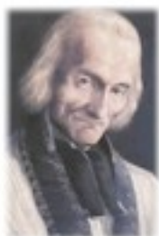
St. John Vianney 1786-1859

The priest continues the work of redemption on earth.... If we really understood the priest on earth, we would die not of fright but of love.... The priesthood is the love of the heart of Jesus.