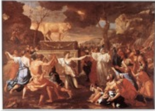
Adoration of the Golden Calf Nicolas Poussin 1628-1634