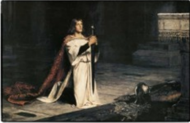
The Vigil John Pettie 1884

“Prayer is both a gift of grace and a determined response on our part. It always presupposes effort.