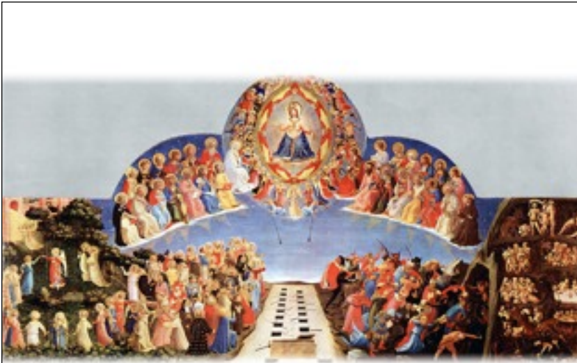
The Last Judgment Pius Angelico 1423-1432

We pray as we live, because we live as we pray.