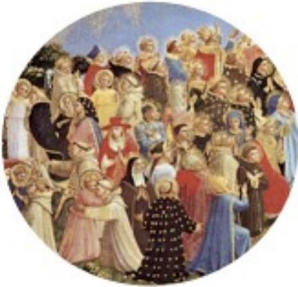
The Last Judgment Pius Angelico 1423-1432