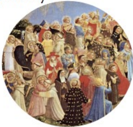
The Last Judgment Piero Angelico 1425-1432