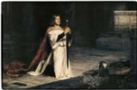
The Vigil John Pettie 1886

facing difficulties in prayer facing temptations in prayer forming a life of prayer