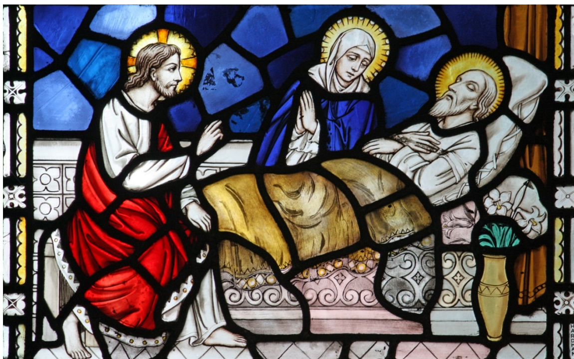
The Death of St. Joseph The Church of Our Lady of the Assumption and the English Martyrs Cambridge, England

Let us pray. O glorious Saint Joseph, spouse of the Immaculate Virgin, obtain for us pure, humble and charitable minds, and perfect resignation to the divine will. Be our guide, father, and model through life, that we may merit to die as you did, in the arms of Jesus and Mary.