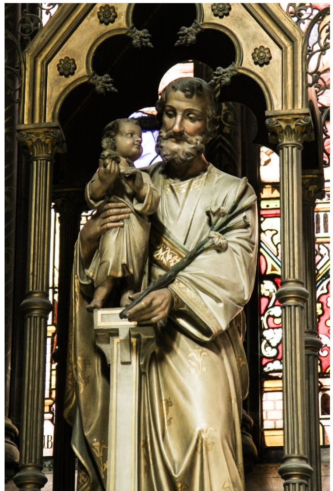
St. Joseph Church of the Sacred Heart of Jesus Lille, France

https://teachingcatholickids.com/st-joseph-saints-for-kids/