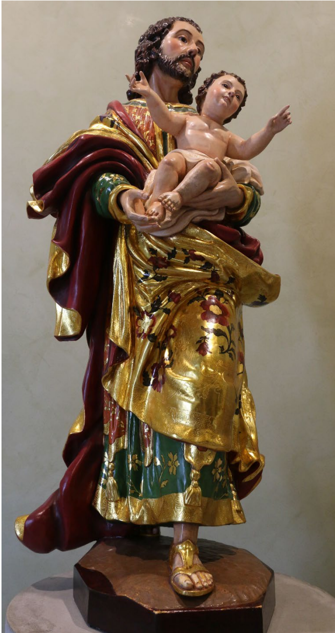
Cathedral of Christ the Light Oakland, CA