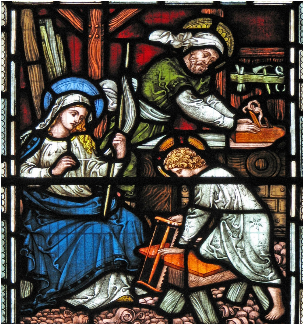
St. Joseph the Worker St. Mary the Virgin Church Freeland, West Oxfordshire, England

When they had finished everything required by the law of the Lord, they returned to Galilee, to their own town of Nazareth. The child grew and became strong, filled with wisdom; and the favor of God was upon him.