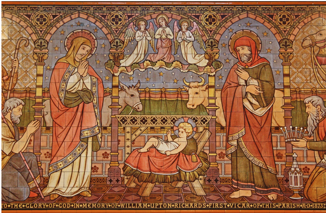
The Nativity of the Lord All Saints Church, Margaret Street, London

After eight days had passed, it was time to circumcise the child; and he was called Jesus, the name given by the angel before he was conceived in the womb.