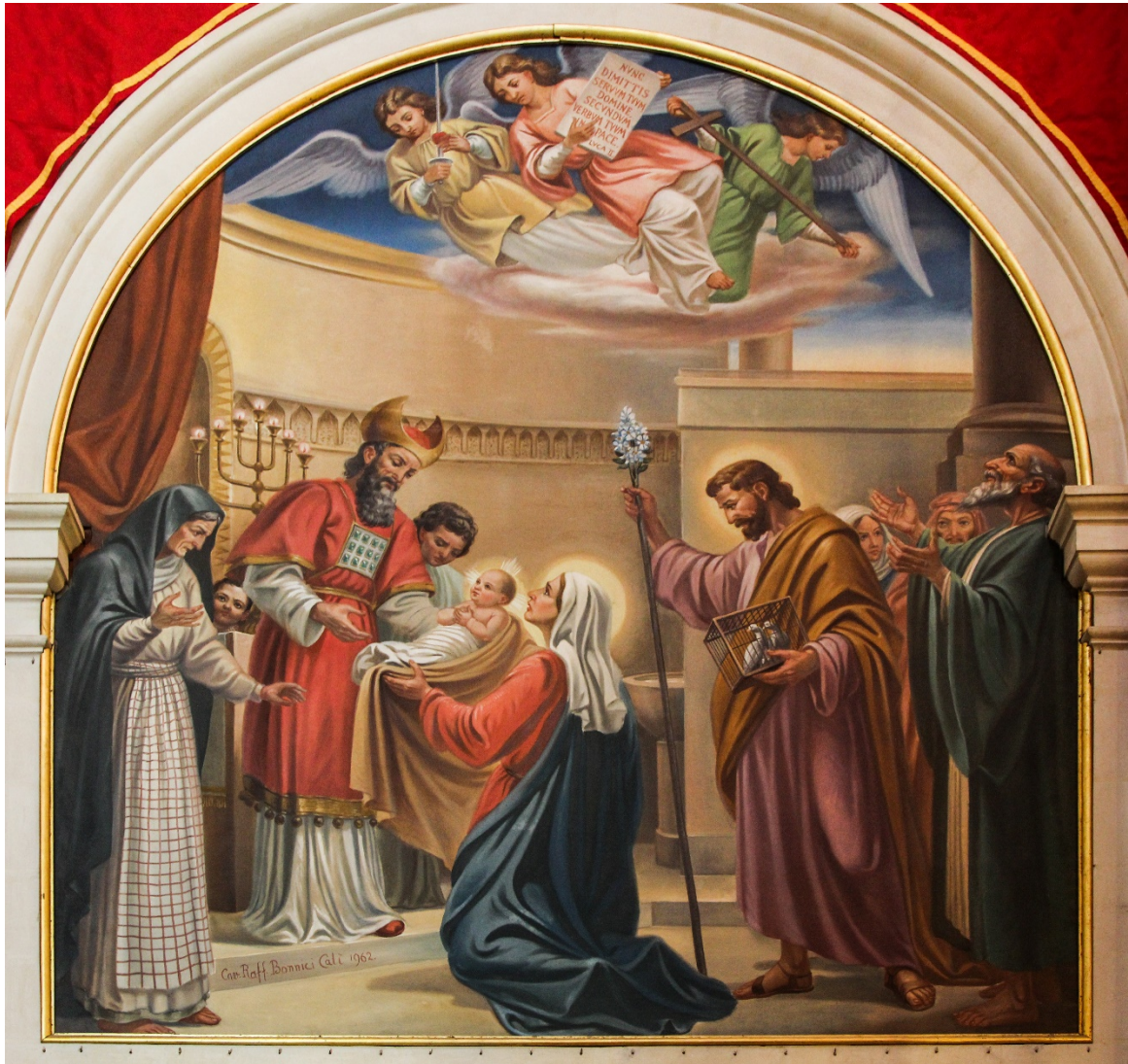
The Holy Family in the Temple Vittoriosa, Malta