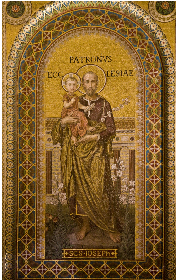
St. Joseph the Guardian Basilica of St. Lawrence Outside the Walls Rome, Italy