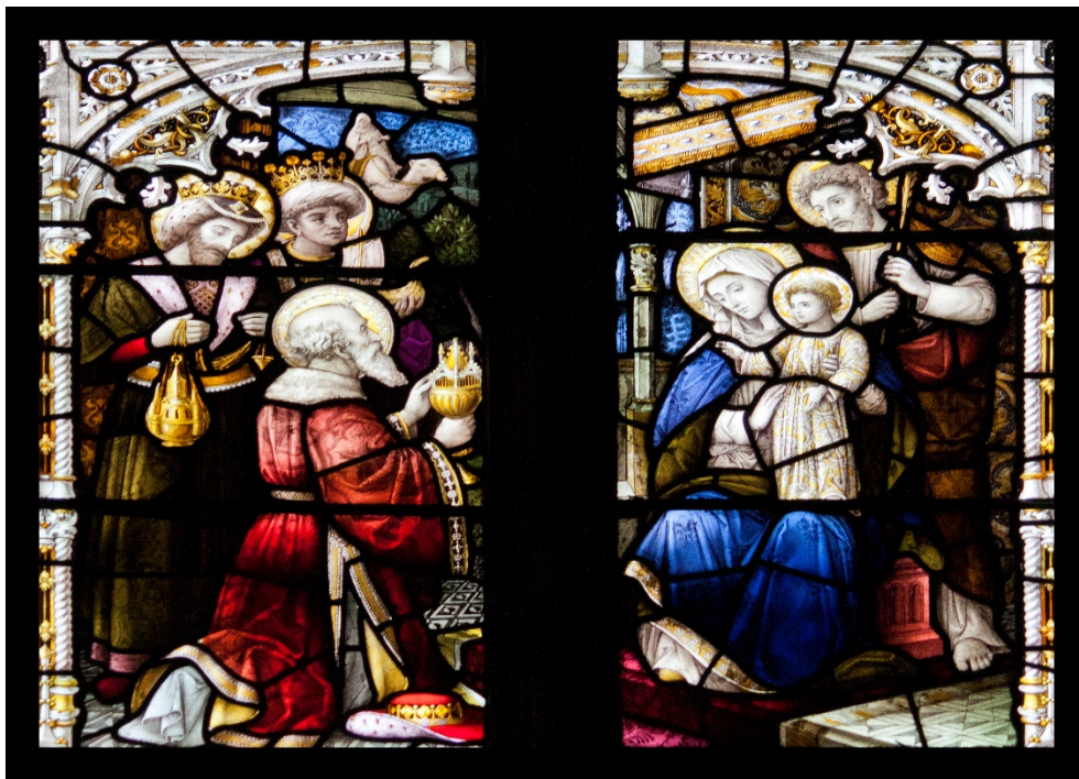
Downside Abbey Church, Benedictine Monastery Stratton-on-the-Fosse, England

Then Herod secretly called for the wise men and learned from them the exact time when the star had appeared. Then he sent them to Bethlehem, saying, “Go and search diligently for the child; and when you have found him, bring me word so that I may also go and pay him homage.” When they had heard the king, they set out; and there, ahead of them, went the star that they had seen at its rising, until it stopped over the place where the child was. When they saw that the star had stopped, they were overwhelmed with joy. On entering the house, they saw the child with Mary his mother; and they knelt down and paid him homage. Then, opening their treasure chests, they offered him gifts of gold, frankincense, and myrrh. And having been warned in a dream not to return to Herod, they left for their own country by another road.