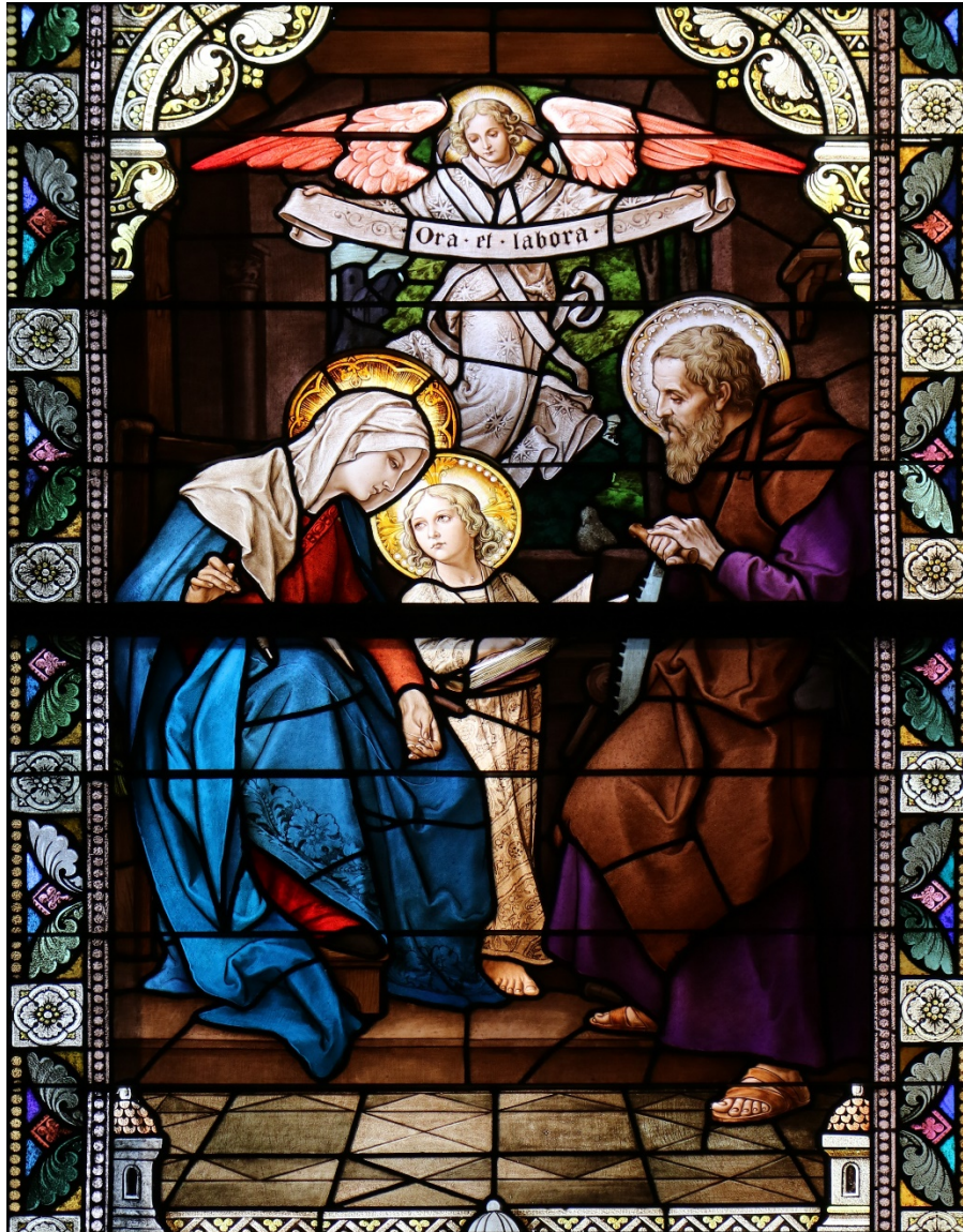
The Holy Family Abbey of Pontigny, Burgundy, France

Blessed Joseph, to us too, show yourself a father and guide us in the path of life. Obtain for us grace, mercy and courage, and defend us from every evil. Amen.