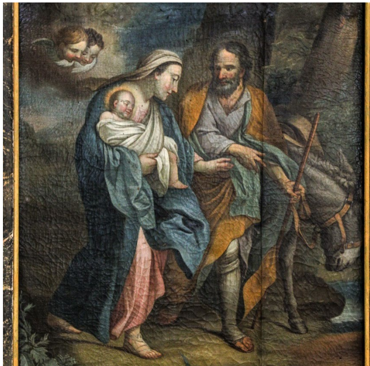
Flight into Egypt Abbey of Pontigny, Burgundy, France

As once you rescued the Child Jesus from deadly peril, so now protect God's Holy Church from the snares of the enemy and from all adversity; shield, too, each one of us by your constant protection, so that, supported by your example and your aid, we may be able to live piously, to die in holiness, and to obtain eternal happiness in heaven. Amen.