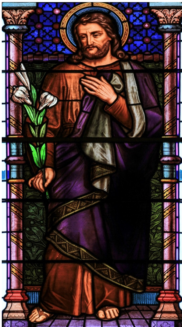
St. Joseph St. Dominic's Church, Washington, DC