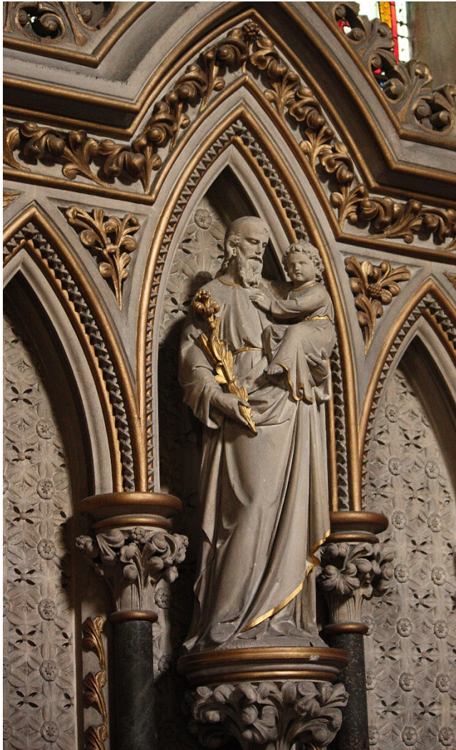
St. Joseph St. Dominic's Priory, London