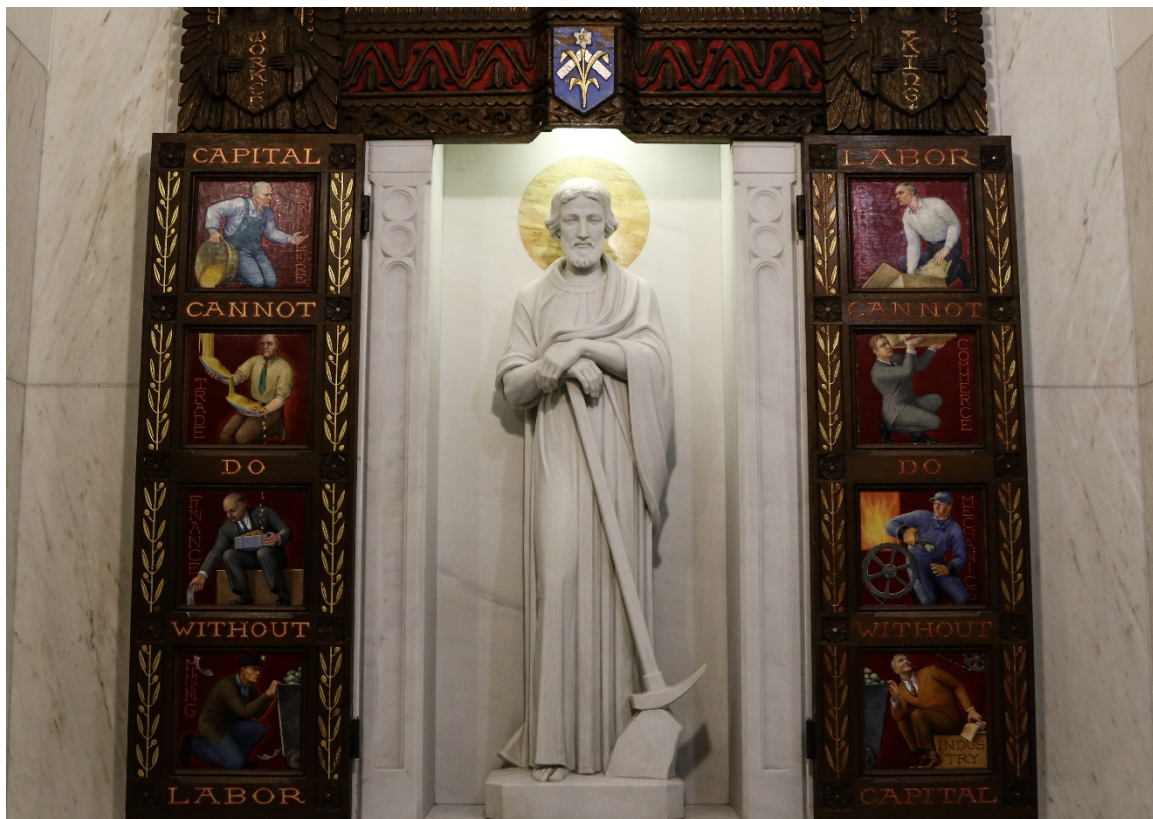
St. Joseph the Worker Basilica of the National Shrine of the Little Flower Detroit, Michigan

God our Father, creator and ruler of the universe, in every age you call man to develop and use his gifts for the good of others. With St. Joseph as our example and guide, help us to do the work you have asked and come to the rewards you have promised.