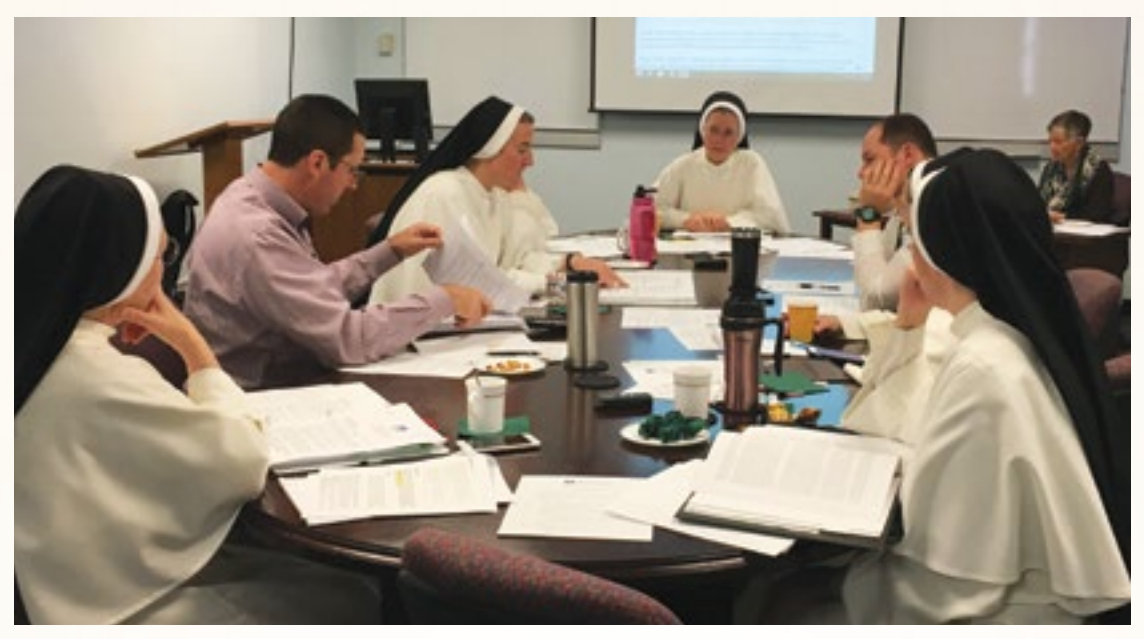
The Strategic Planning Committee

teaching and the witness of their lives. Thus they share in the Dominican charism of preaching and the salvation of souls .